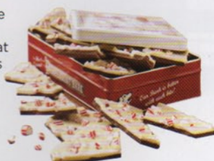
Peppermint Bark, $26.50, at Williams-Sonoma