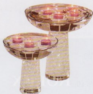
Tea light holder, $2.99, at Yankee Candle

If you're watching your budget, Things Remembered features elegant but affordable pens starting at around $20 from Cross (3), Marquis by Waterford (4), and its own line, Reflections (5). In silver and gun metal, the pens can be engraved for a special someone.