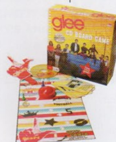
"Glee" DVD game, $28, Urban Outfitters